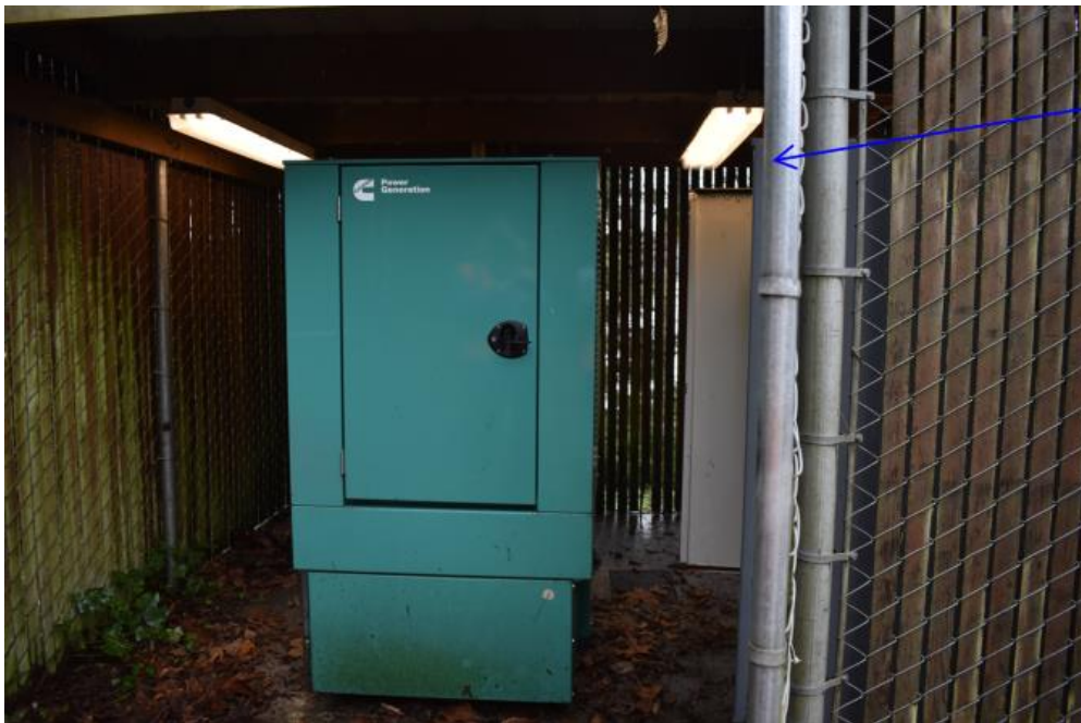
PS 16 – Generator Enclosure